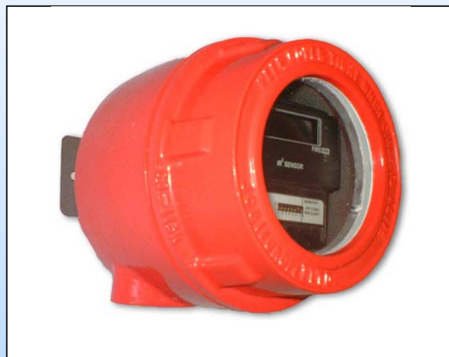
Part no: 016519

The IR 3 Flame Detector signals an alarm state by switching an alarm latch on, increasing the current drawn from the supply from 8mA to 28mA and closing the contacts of a Fire relay RL1. These signals from the detector are recognised by the control panel as an alarm signal.