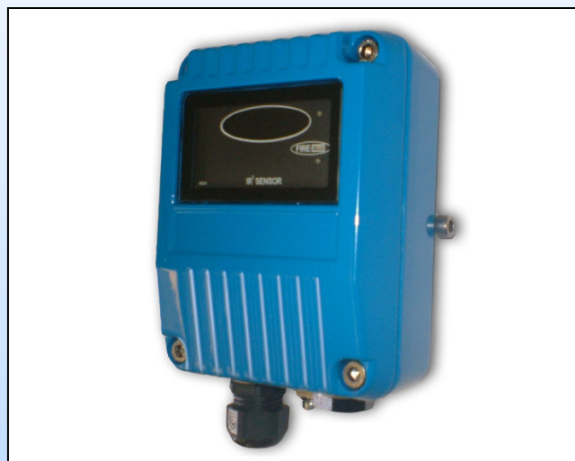
Part no: 016581

The IR 2 Flame Detector signals an alarm state by switching an alarm latch on, increasing the current drawn from the supply from 8mA to 28mA and closing the contacts of a Fire relay RL1. These signals from the detector are recognised by the control panel as an alarm signal.