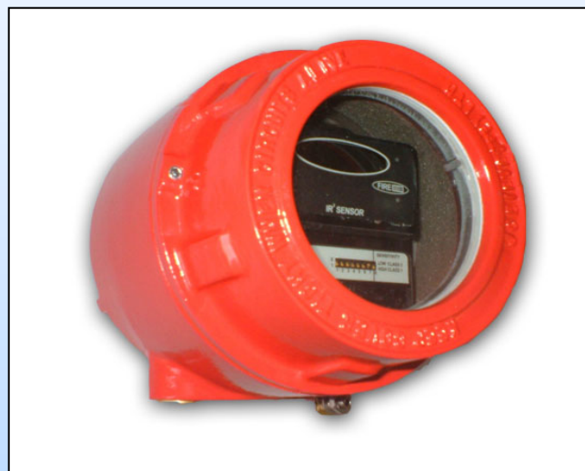
Part no: 016511

The IR 2 Flame Detector signals an alarm state by switching an alarm latch on, increasing the current drawn from the supply from 8mA to 28mA and closing the contacts of a Fire relay RL1. These signals from the detector are recognised by the control panel as an alarm signal.